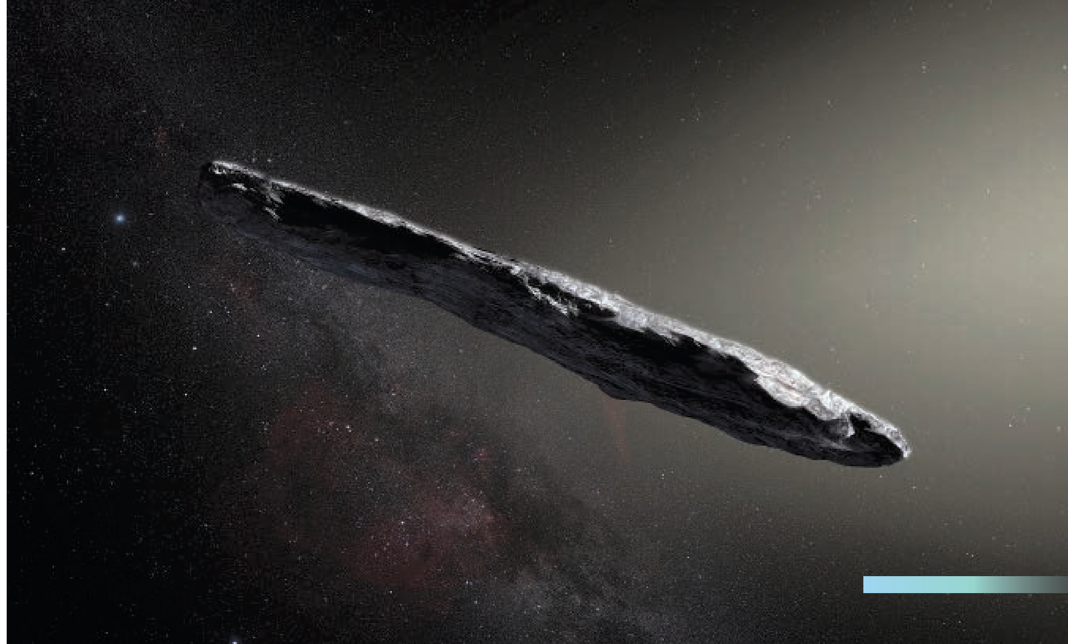
↑ An artist's rendering of 'Oumuamua. Astronomers calculated the far-off object's unusual shape based on the ways it brightened and dimmed as it rotated.

Scientists proposed various theories in scientific journals. Maybe 'Oumuamua was a piece of a Pluto-like planet ejected