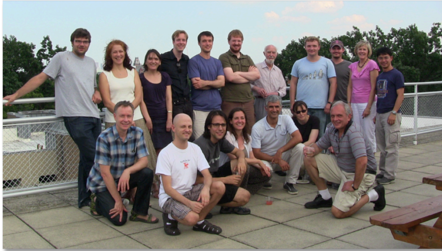
ITAMP Staff, Students & Visitors Postdoctoral Fellows Farewell Gathering