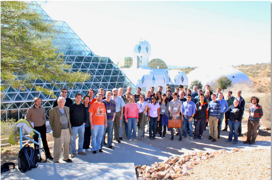
Winter School 2012 January 8-20 B2 Institute University of Arizona